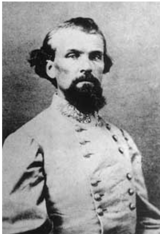
LIEUTENANT GENERAL NATHAN B FORREST – THE WIZARD